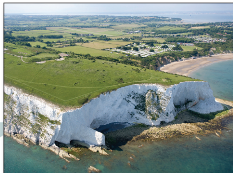
Culver Down and Whitecliff Bay.