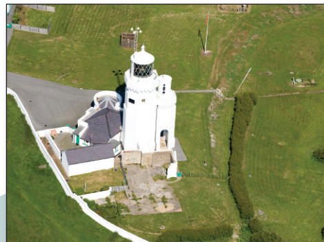
St Catherine's lighthouse, built in 1840.