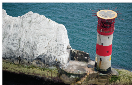
Above and left: The Needles light.