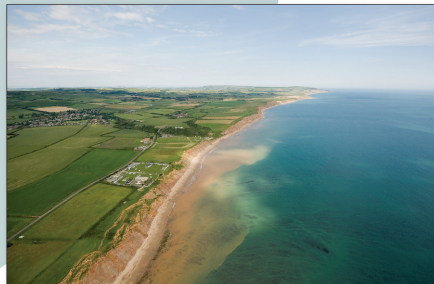
Spectacular views eastwards towards St Catherine's Point.