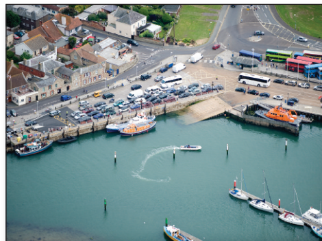
The harbour and lifeboat station, Yarmouth.